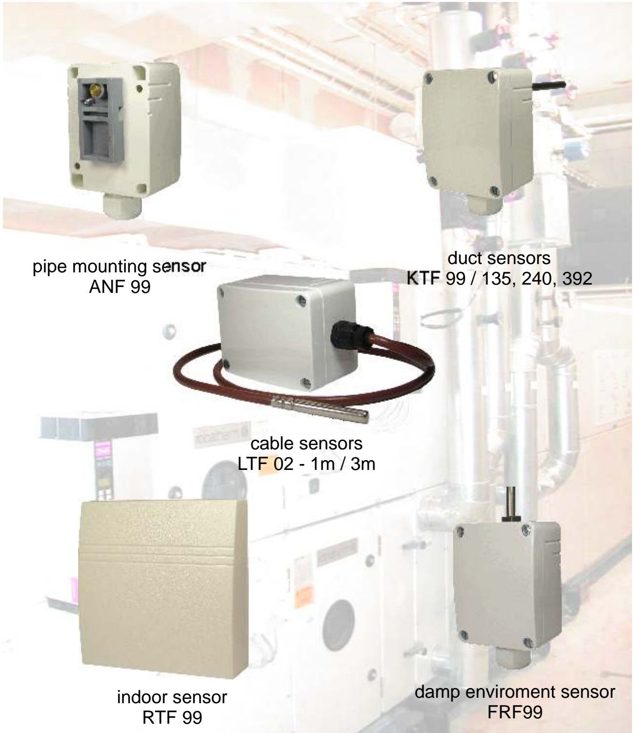
pipe mounting sensor ANF 99