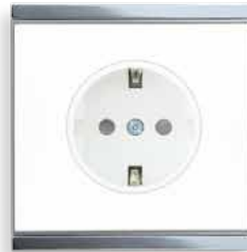
Corlo Power Outlet, chrome glossy