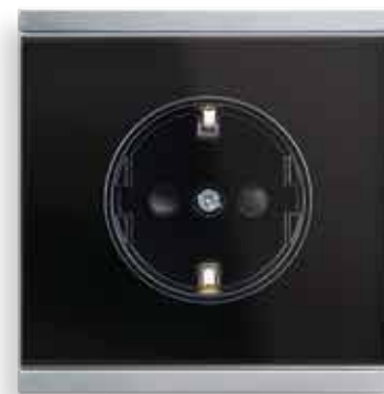
Corlo Power Outlet, chrome matt