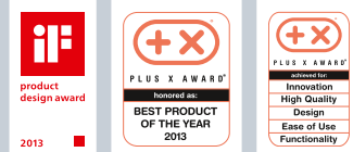
Awards for Corlo Touch KNX