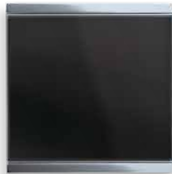
Corlo Push Button M1-T, chrome glossy