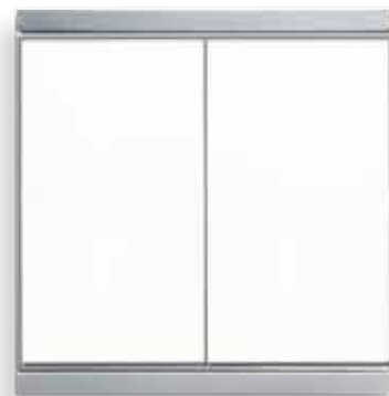
Corlo Push Button M2-T, chrome matt

All components of System Corlo are installed in standard sockets. Frames are available as 1-, 2- or 3-gang version. The Wireless push buttons Corlo P RF can be mounted without a socket directly on the wall with special frames Corlo Plane .