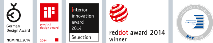
Awards for System Corlo

High-resolution 3.5 inch display with brightness sensor for automatic adjustment of the display to ambient brightness. Shows current weather data, room data or messages from the KNX bus system. Personalised screensaver with your own photos.