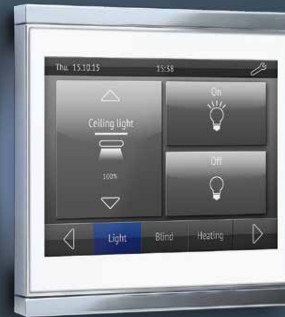
Corlo Touch KNX